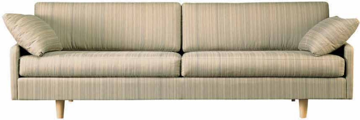
DESIGN: NORMAN & QUAINÉ